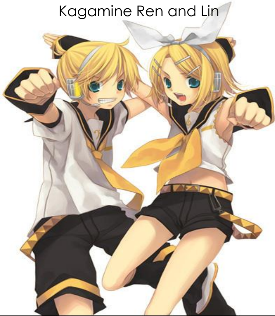
Kagamine Ren and Lin